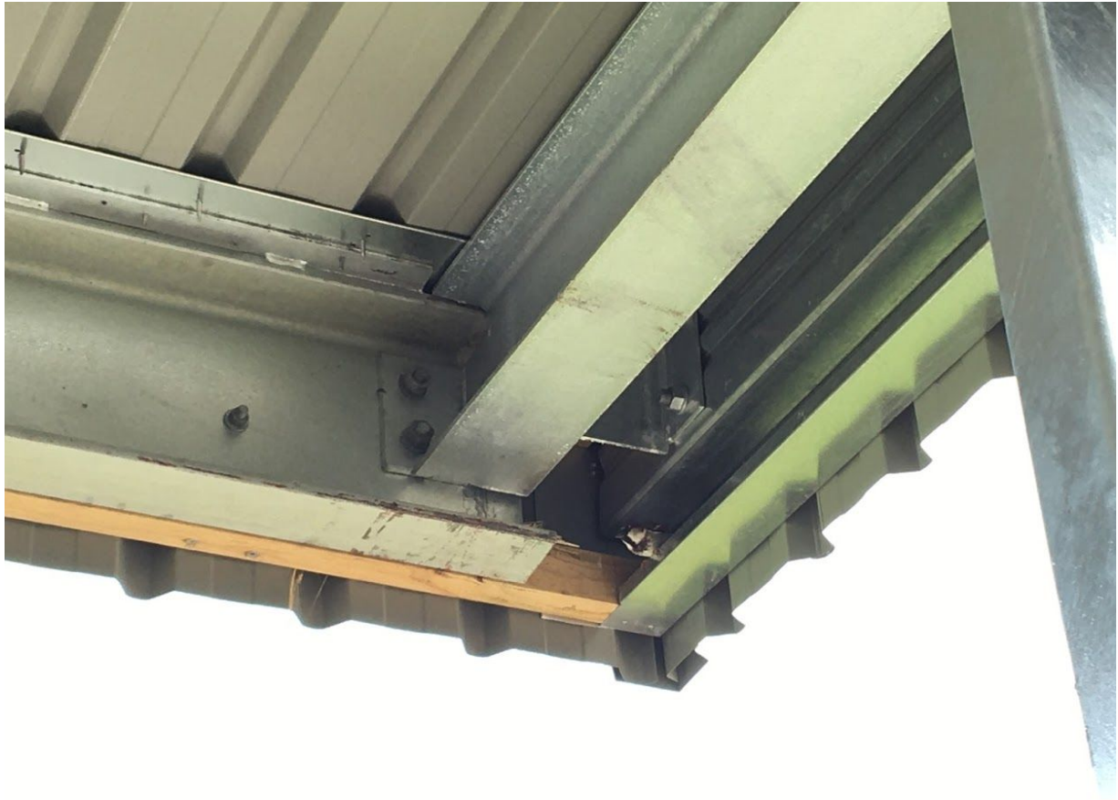
Bird Proofing Solution for Two Corners of Grandstand Roof