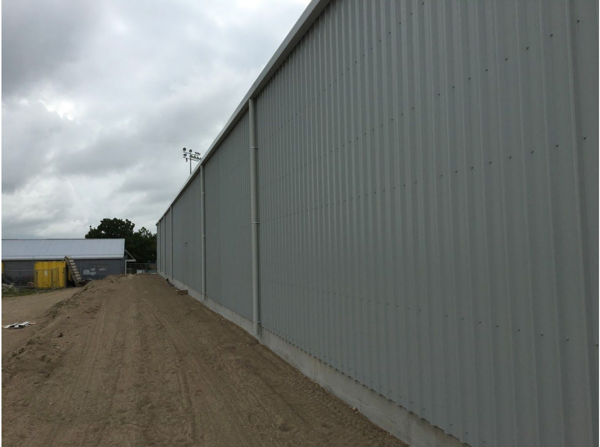
Resolution to Differential in Cladding Colour/Appearance to Rear Wall