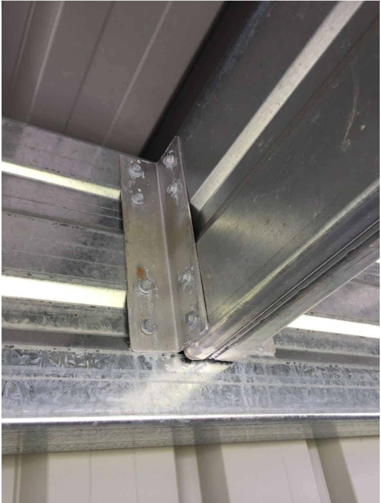
Intermediate Purlin Brackets to be Replaced