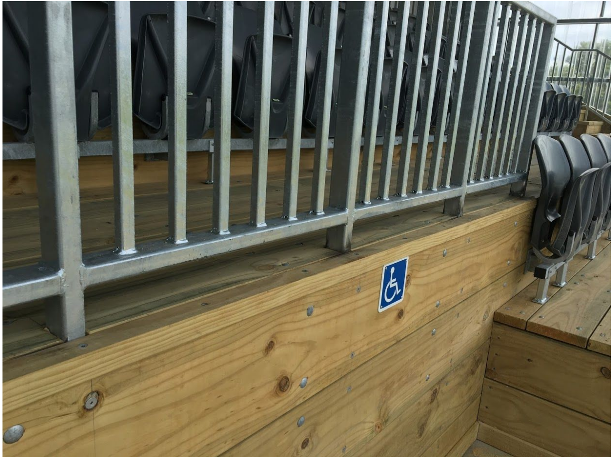
Three Char Damaged Timbers to be Replaced