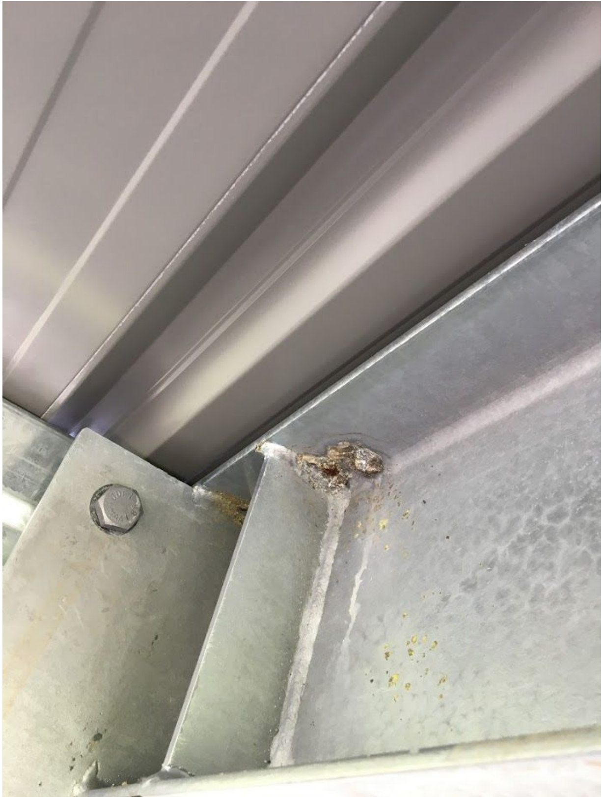
Residue Galvanising Slag to be Removed and Local Galve Repair as Required