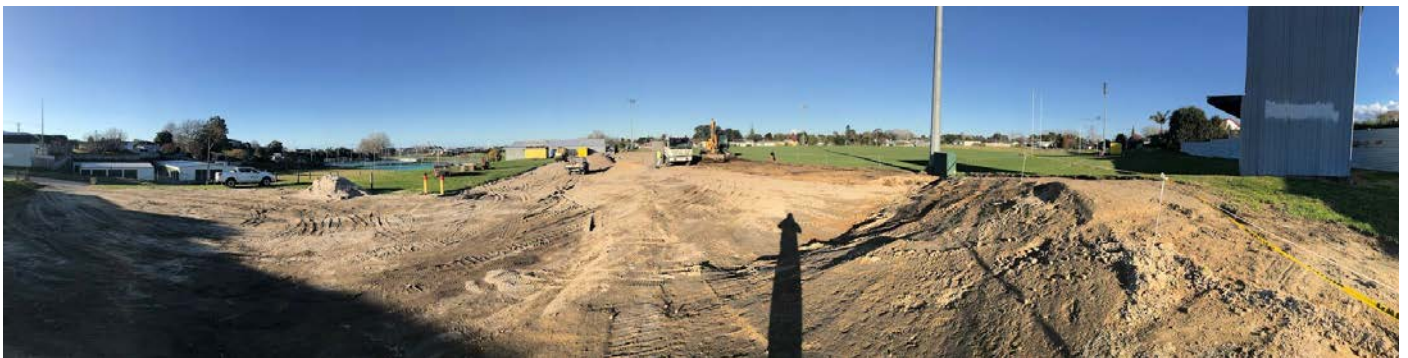
Photo Record - Key Construction stages